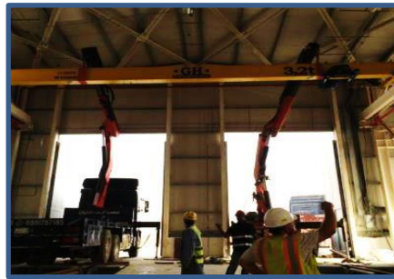
Rail Drop System